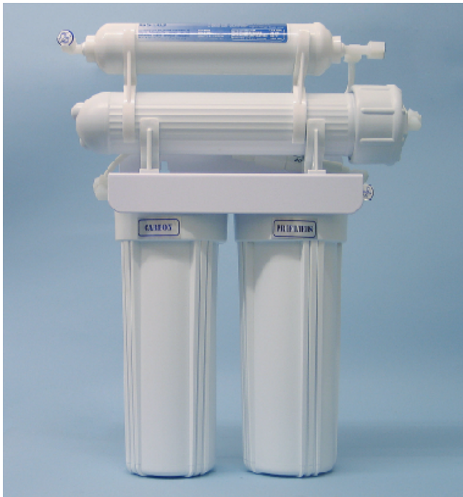
SRO-50 Reverse Osmosis System