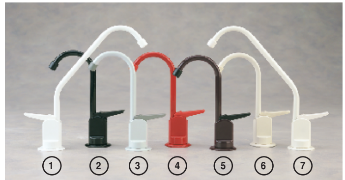
Coloured taps - 1 white, 2 black, 3 grey, 4 red, 5 brown, 6 almond, 7 bisque.

Regular and Long Reach spouts are interchangeable.