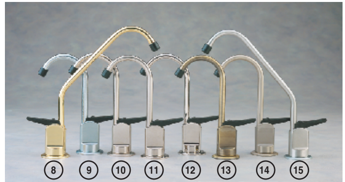
Metal taps - 8 polished brass, 9 brushed chrome, 10 brushed nickel, 11 satin nickel, 12 polished nickel, 13 antique brass, 14 pewter, 15 brushed stainless (+£10).