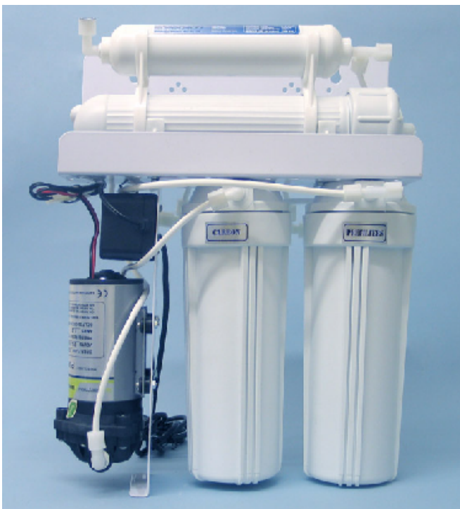
SRO-50P Reverse Osmosis System