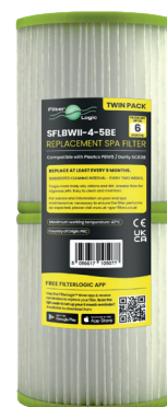
Supplied in Twin Packs