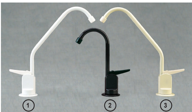
Coloured taps - 1 White, 2 Brown, 3 Almond

Whatever your decor, Pozzani offer a choice of taps to suit, chromium (standard), various metal and ceramic painted finishes